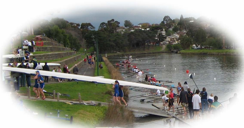
Post race pack-up. The last 10 to finish