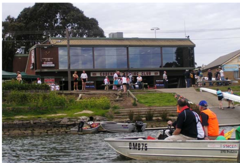
Essendon Rowing Club from the river