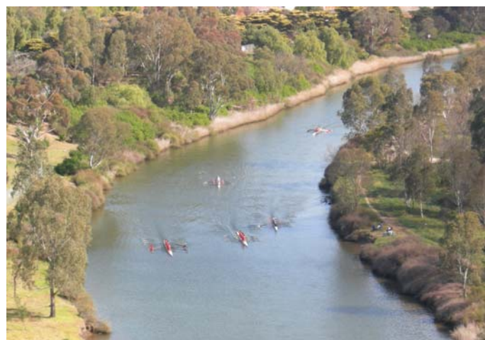
The view from Lily Street Park. Five quads approaching Sand Caves 120° corner