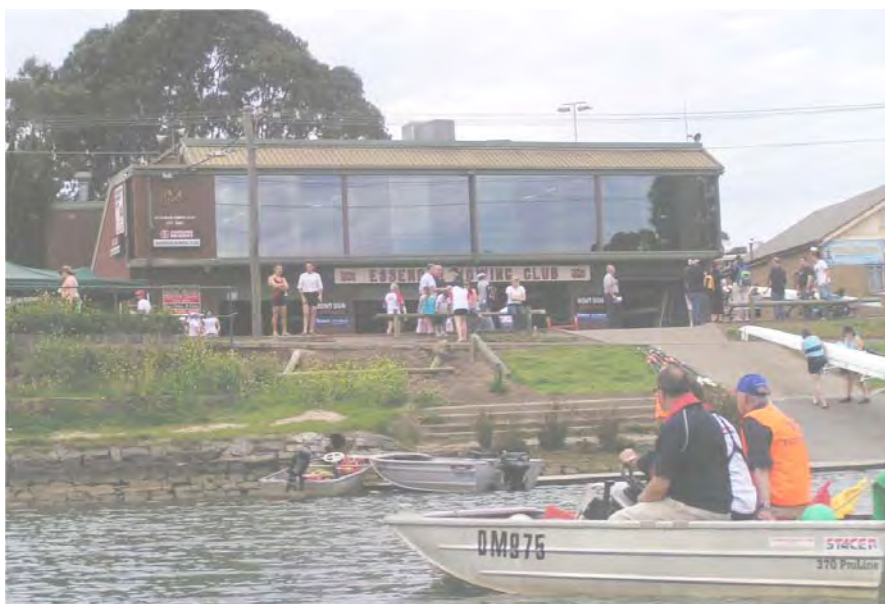
Essendon Rowing Club from the river

The club has been established since 1880 and has consistently been judged by Rowing Victoria as one of the best regatta hosts in Victoria.