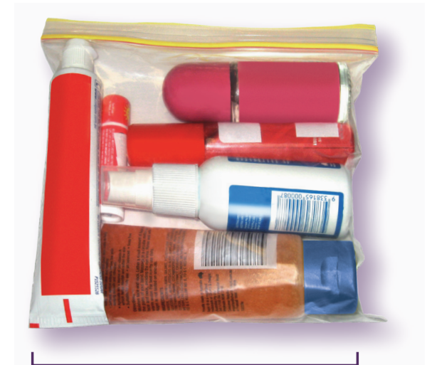
Size about 20 x 20cm